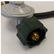
LCC27 appliance connection

Has a visible external thread on the valve