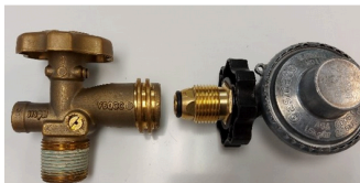
LCC27 Valve & POL Appliance Connection