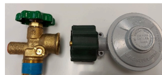
POL Valve + LCC27 Appliance Connection