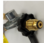
POL appliance connection

Does not have an external thread on the valve