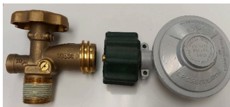
LCC27 valve + LCC27 appliance connection

You should remember to ensure “when making your selection, match your gas hose connection”