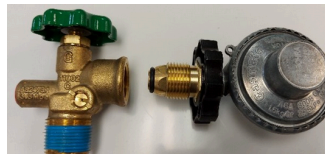
POL valve + POL appliance connection