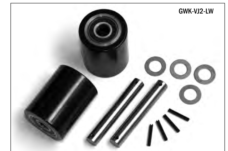
Load Wheel Kit