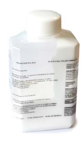
Bottle of polish compound (100ml)