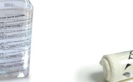
Bottle of water solution (100ml)