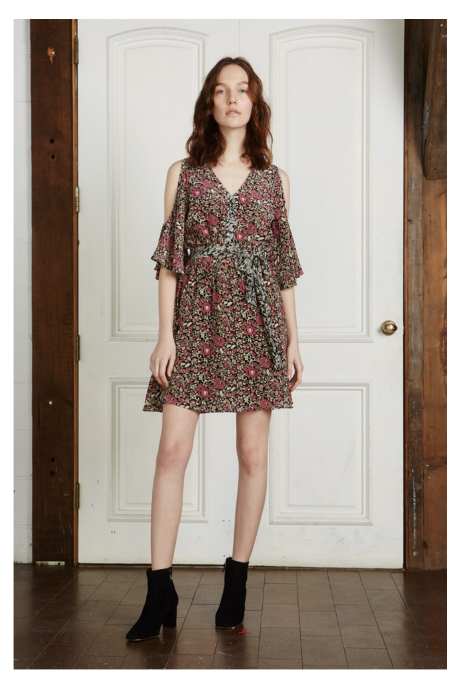
Look 3: Tea Dress, "Bramble" Hand Screen Print on Silk Crepe, Black Ground w/ Flowers