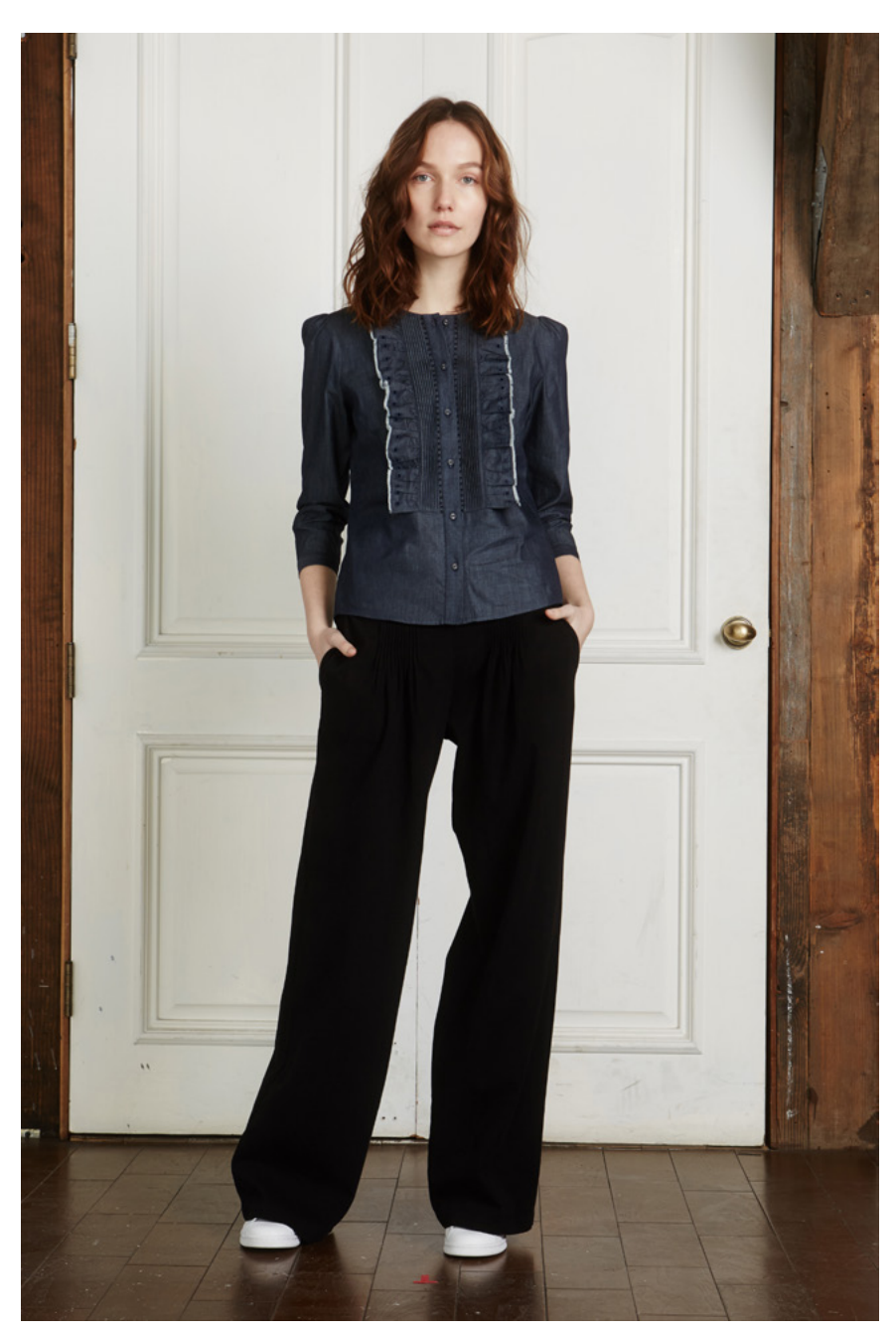
Look 11: Emma Shirt, "Goldbourne" Eyelet Embroidery, 100% Cotton Denim, Dark Indigo Rinse