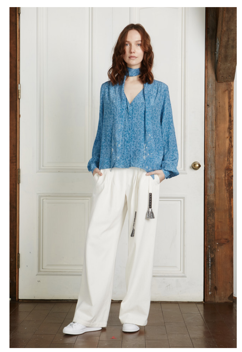
Look 8: Autumn Blouse, "Bramble" Hand Screen Print on Silk Crepe, Sky Blue Ground w/ Flowers