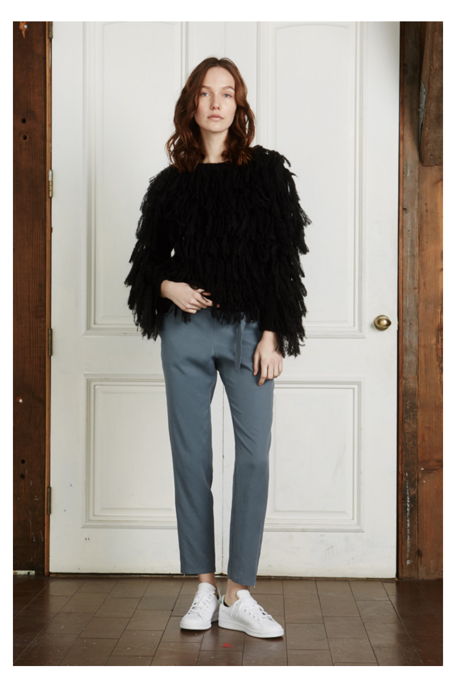
Look 9: Babe Sweater, "Shag" Knit Alpaca, Black Dee Pants, Tencel™, Storm