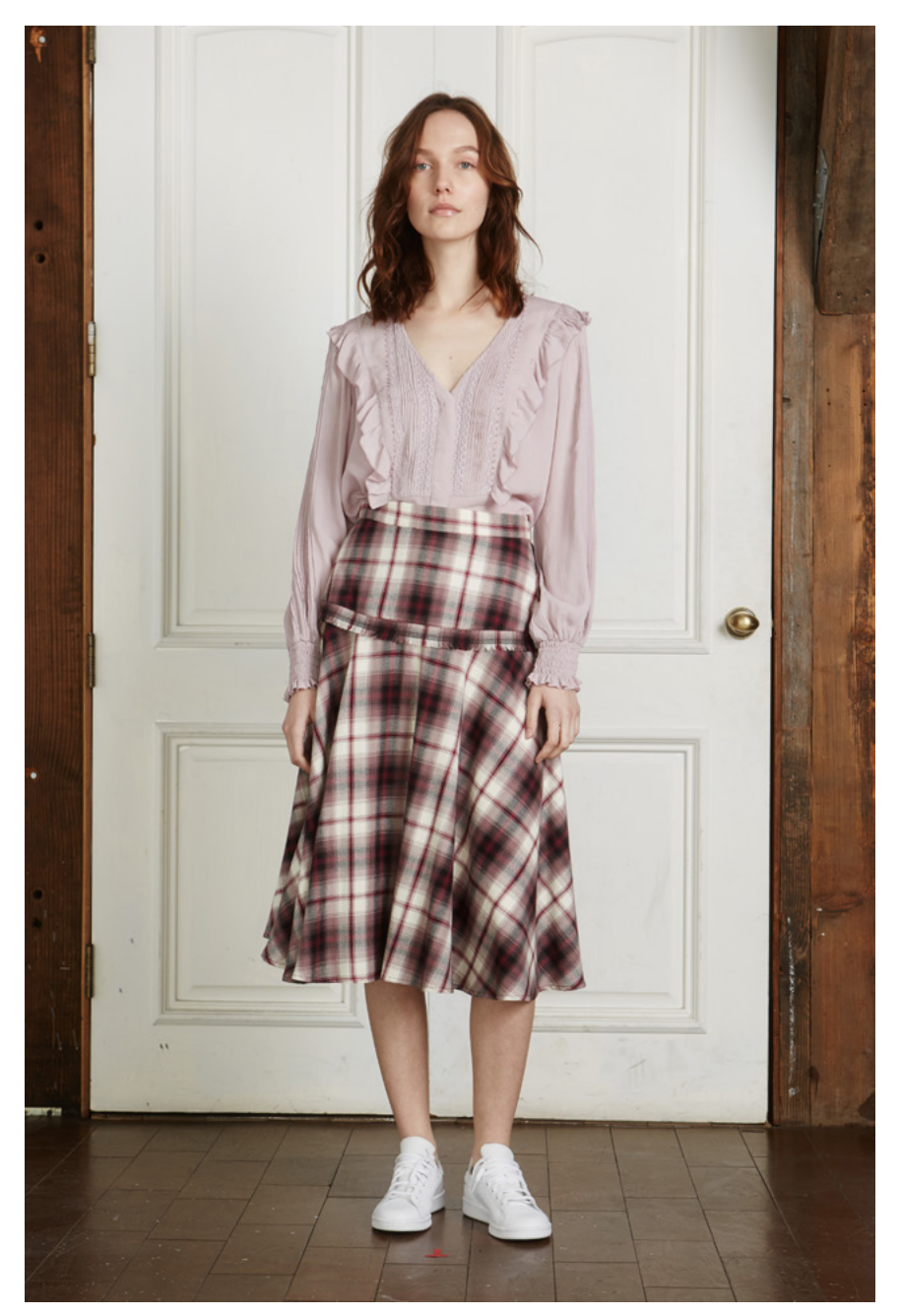
Look 22: Billy Blouse, Cotton Lace and Knots on Viscose, Heather Daisy Skirt, "Westway" Brushed Cotton Flannel, Berry Plaid