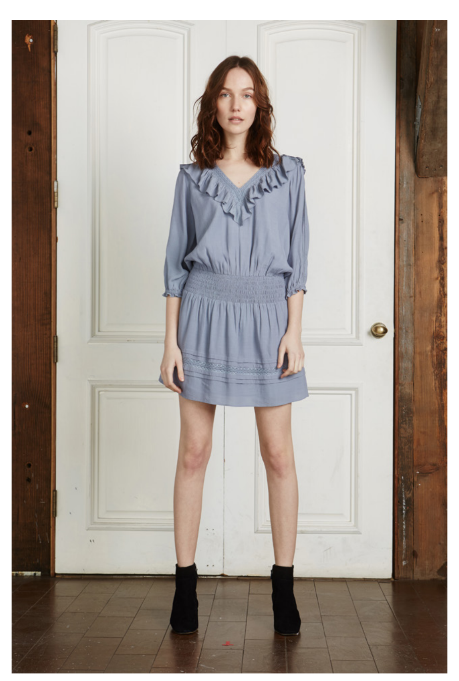
Look 16: Suzanne Dress, Cotton Lace and Knots on Viscose, Wedgewood Blue