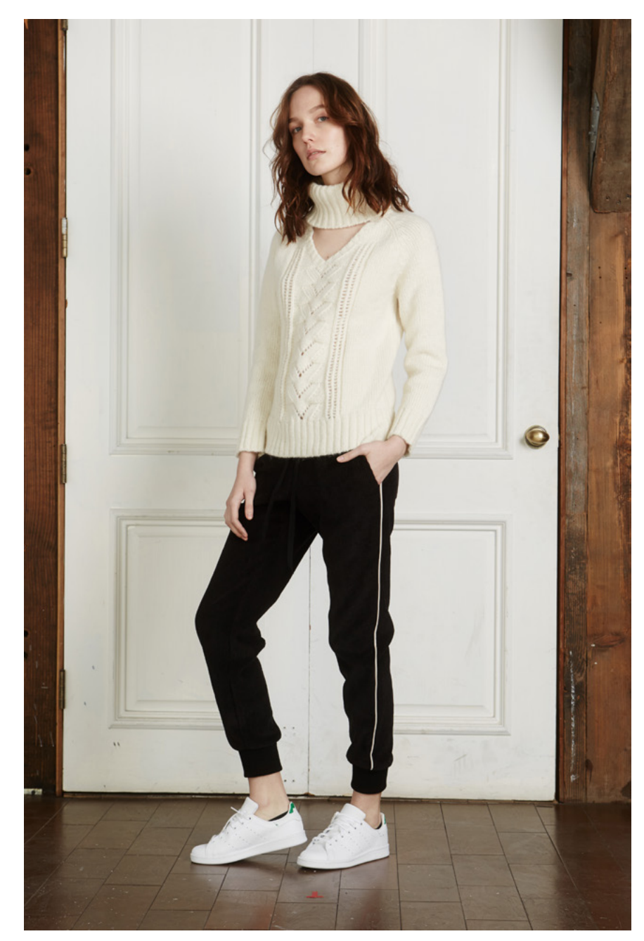
Look 20: Jemima Sweater, "Pointelle" Knit, Alpaca, Milk James Pants, Organic Hemp / Cotton Corduroy, Black w/ Ivory