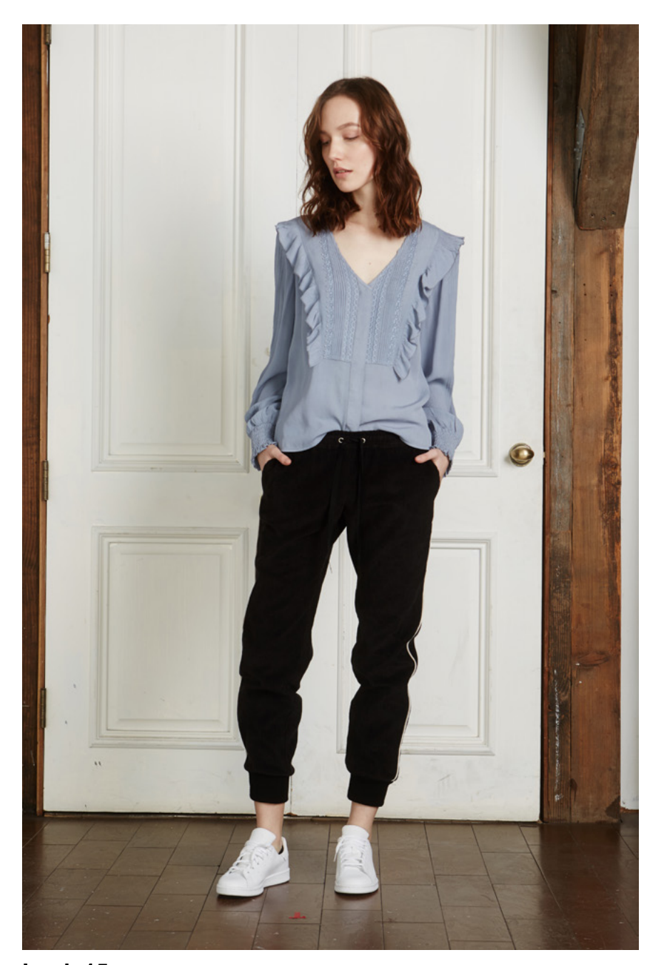
Look 15: Billy Blouse, Cotton Lace and Knots on Viscose, Wedgewood Blue James Pants, Organic Hemp / Cotton Corduroy, Black w/ Ivory