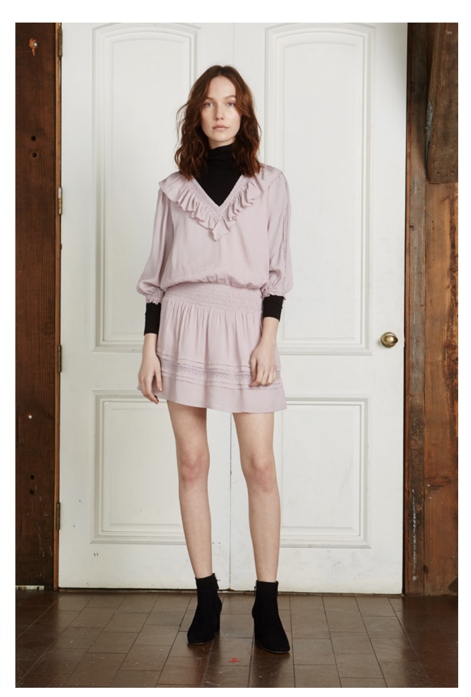
Look 19: Suzanne Dress, Cotton Lace and Knots on Viscose, Heather