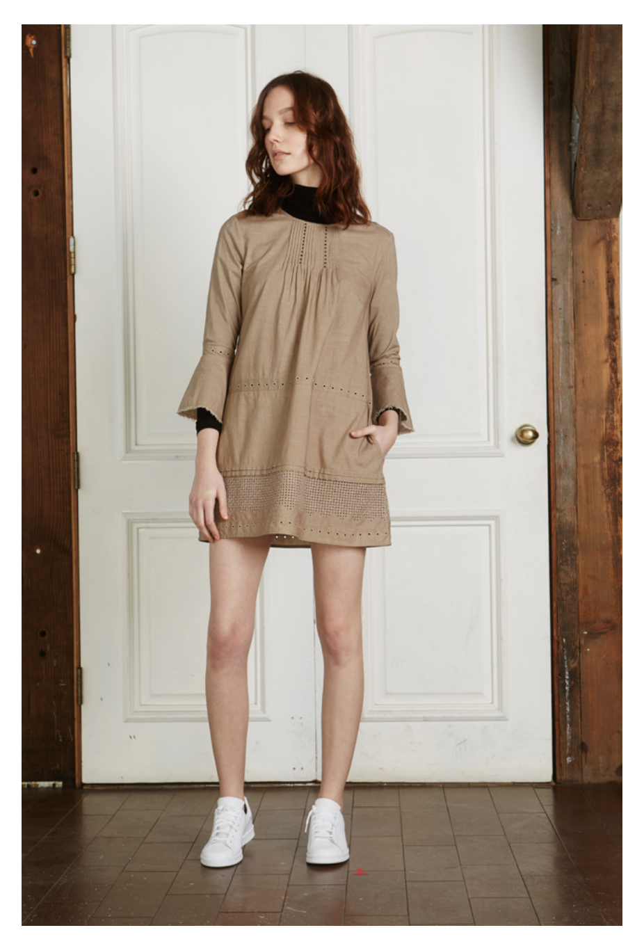
Look 2: Liberty Dress, "Goldbourne" Eyelet on Khadi Handloom, Kakhi