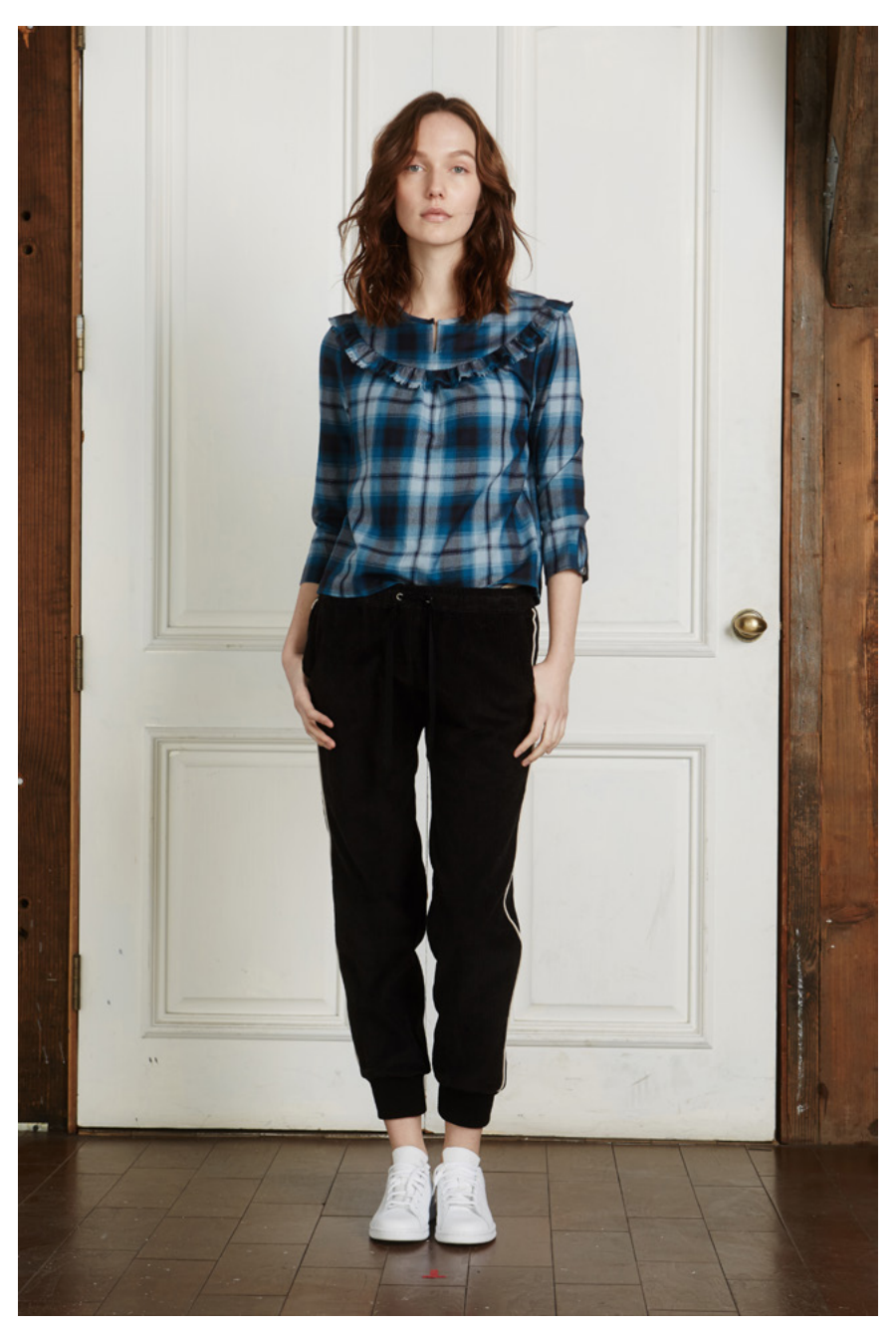
Look 13: Celia Top, "Westway" Brushed Cotton Flannel, Blues Plaid James Pants, Organic Hemp / Cotton Corduroy, Black w/ Ivory