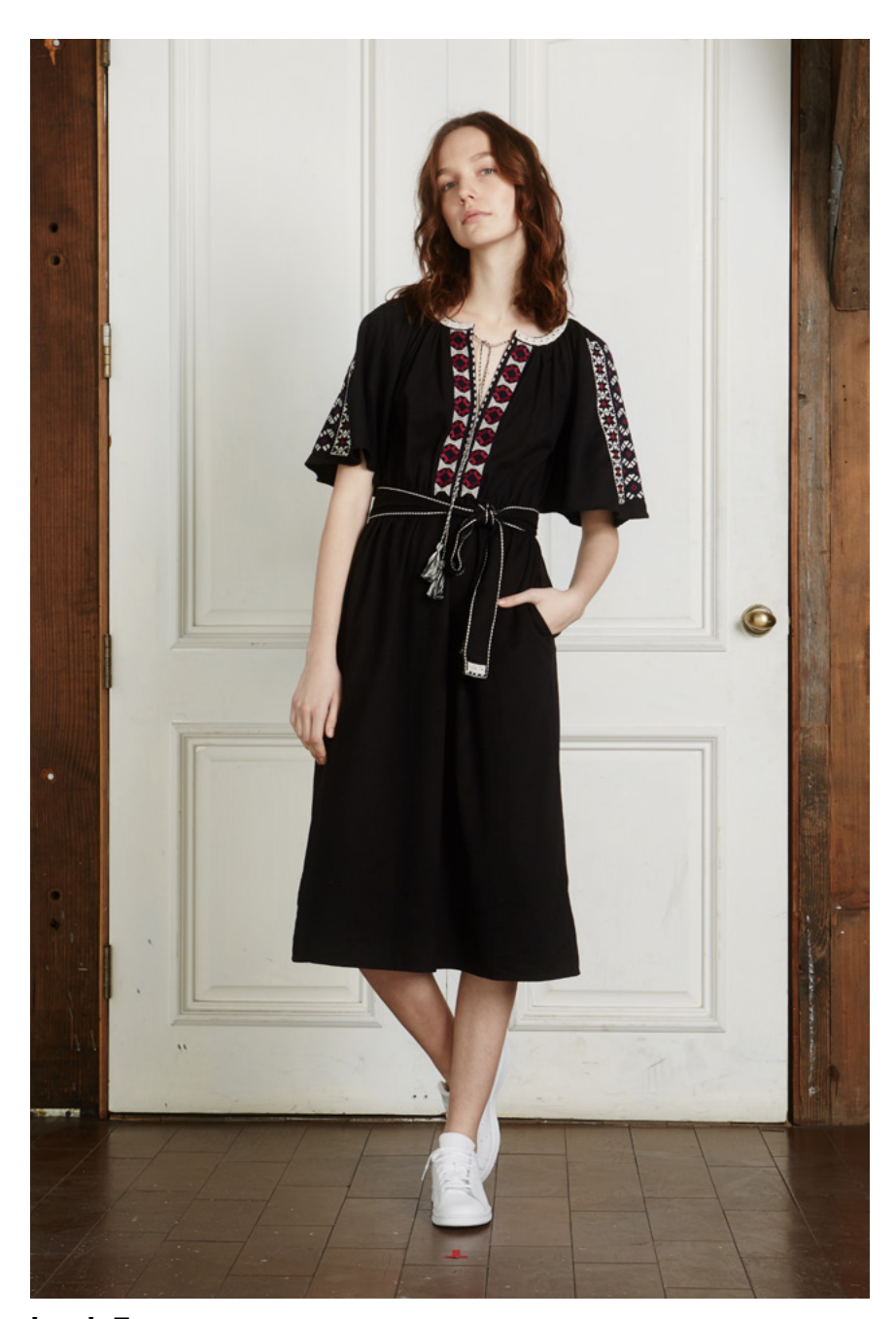
Look 7: Harmony Dress, "Elgin" Embroidery, Brushed Cotton, Black