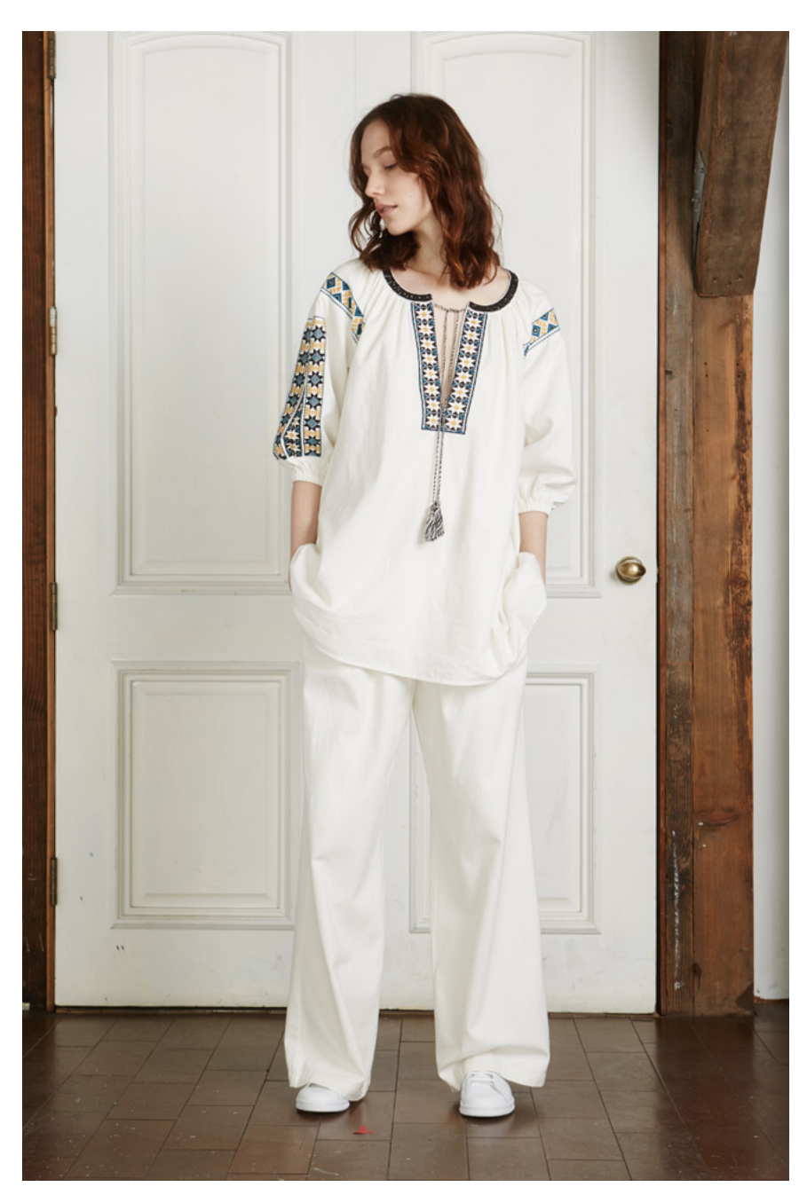
Look 7: Sheila Dress, "Elgin" Embroidery, Brushed Cotton, Milk Pintuck Pants, Brushed Cotton, Milk