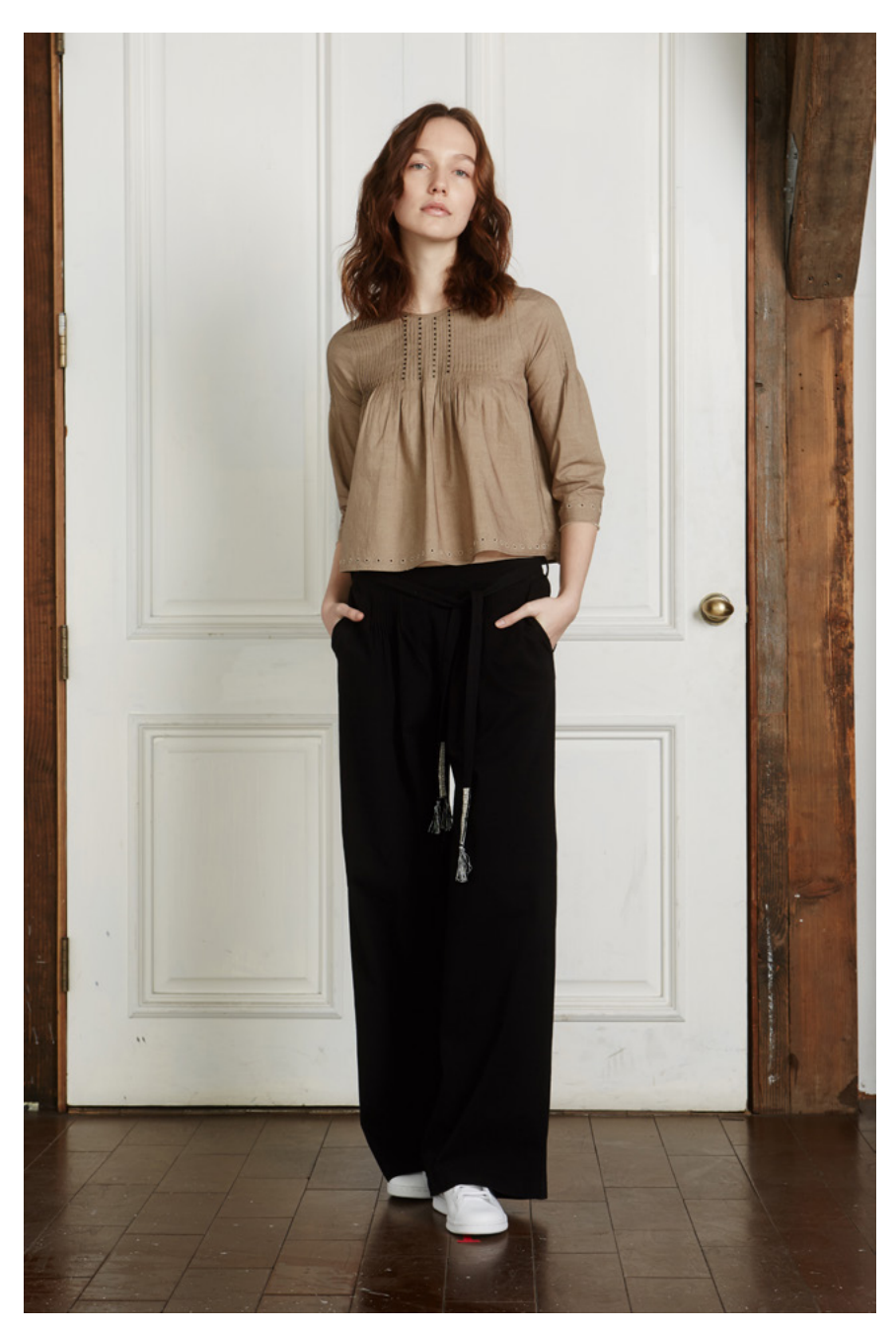
Look 1: Emma Shirt, "Goldbourne" Eyelet on Khadi Handloom, Kakhi Pintuck Pants, Brushed Cotton, Black