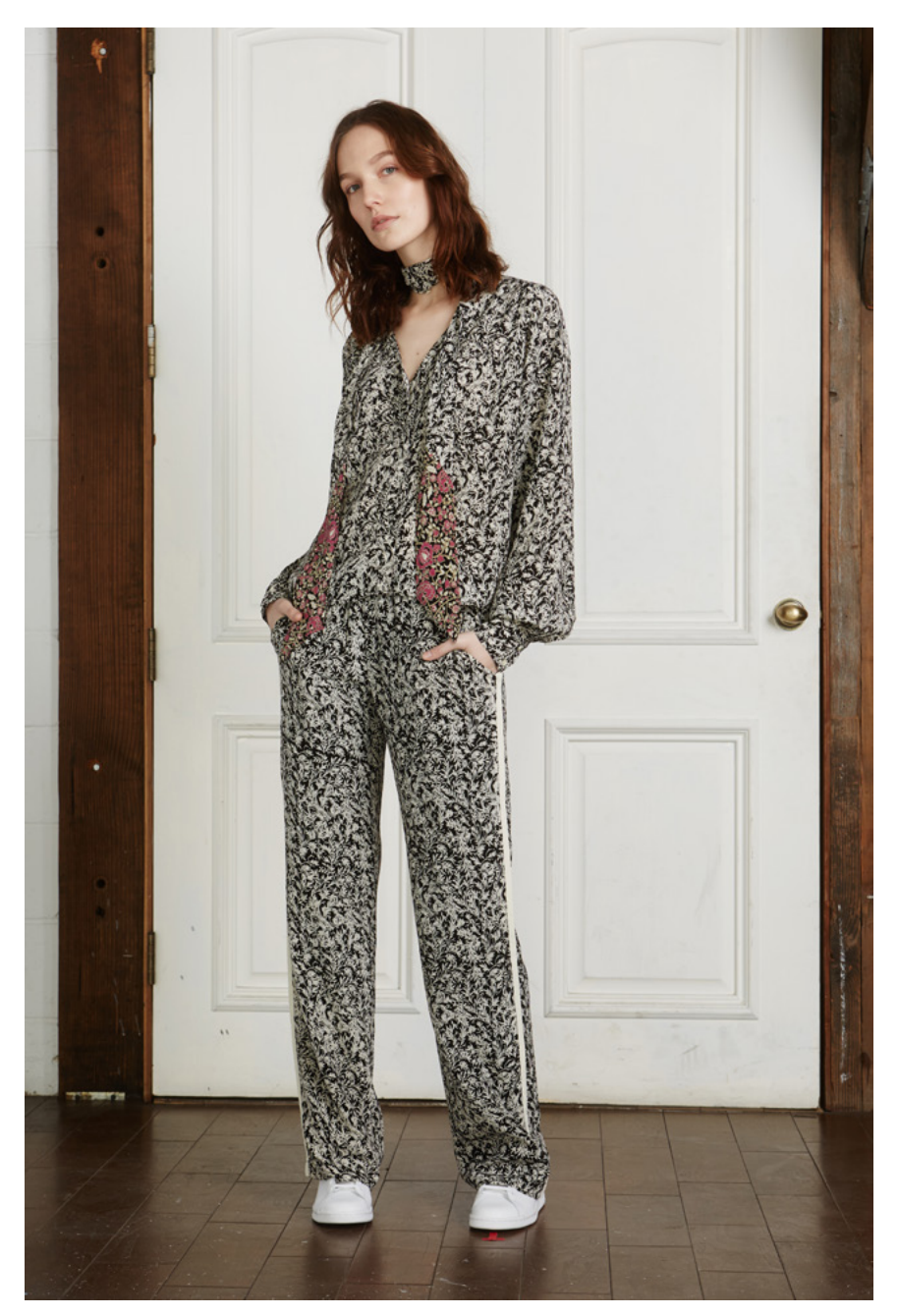
Look 4: Autumn Blouse and Pajama Pant, "Bramble" Hand Screen Print on Silk Crepe, Black Ground w/ Leaves