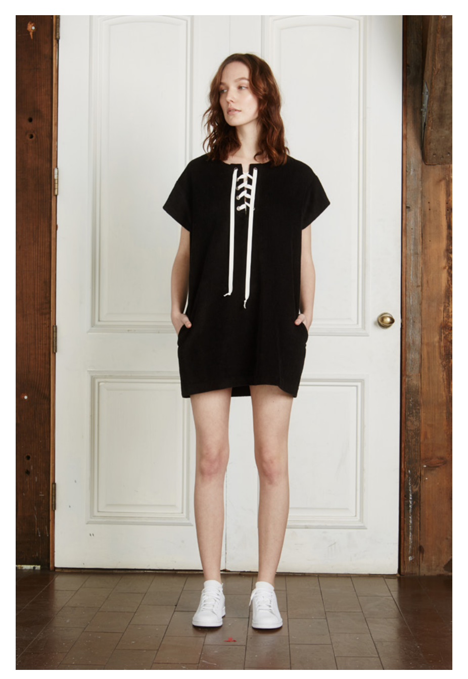
Look 18: Danny Dress, Organic Hemp / Cotton Corduroy, Black w/ Ivory