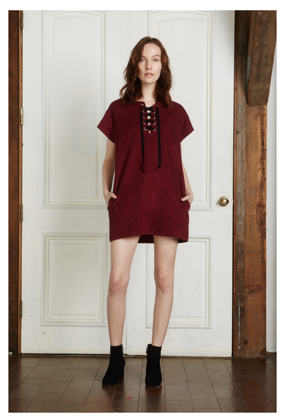
Look 24: Danny Dress, Organic Hemp / Cotton Corduroy, Garnet w/ Black