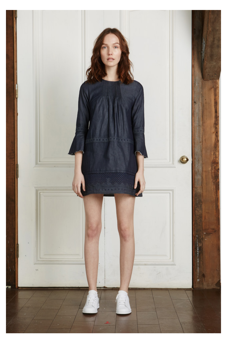
Look 12: Liberty Dress, "Goldbourne" Eyelet Embroidery, 100% Cotton Denim, Dark Indigo Rinse