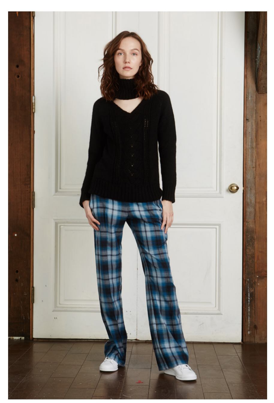
Look 17: Jemima Sweater, "Pointelle" Knit, Alpaca, Black Wide Leg Pants, "Westway" Brushed Cotton Flannel, Blues Plaid