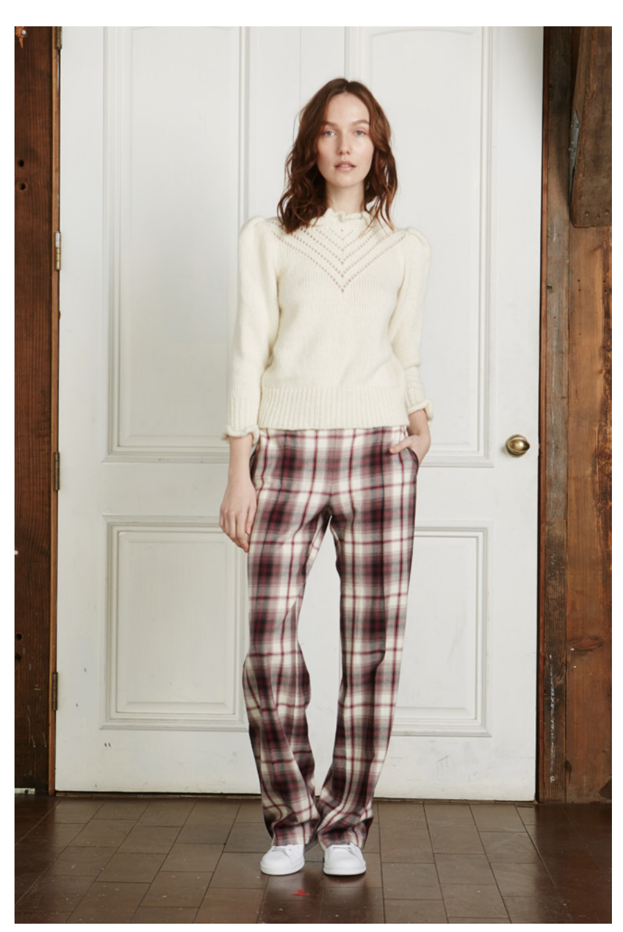
Look 25: Nell Sweater, "Pointelle" Knit, Alpaca, Milk Wide Leg Pants, "Westway" Brushed Cotton Flannel, Berry Plaid