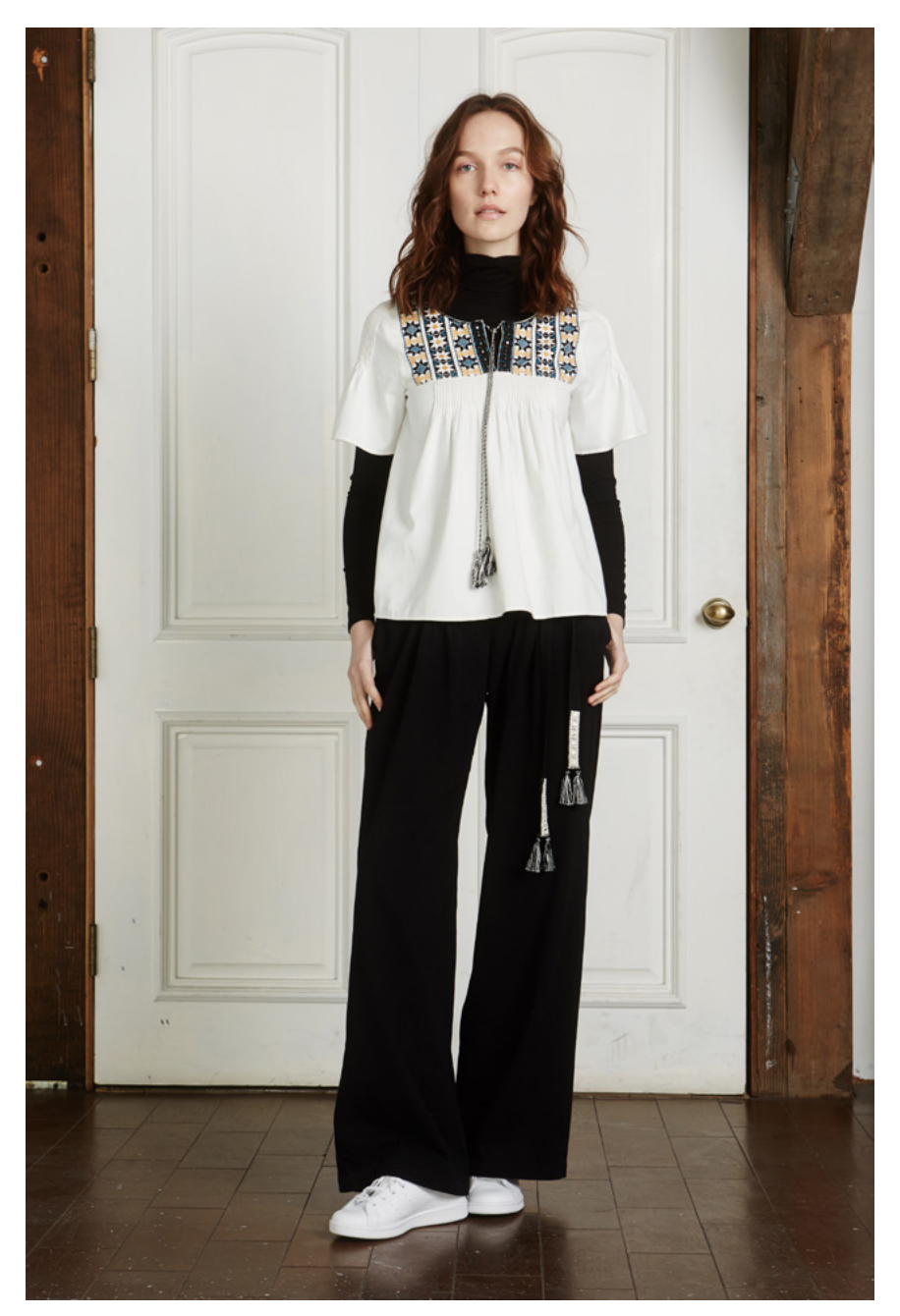
Look 8: Lily Top, "Elgin" Embroidery, Brushed Cotton, Milk Pintuck Pants, Brushed Cotton, Black