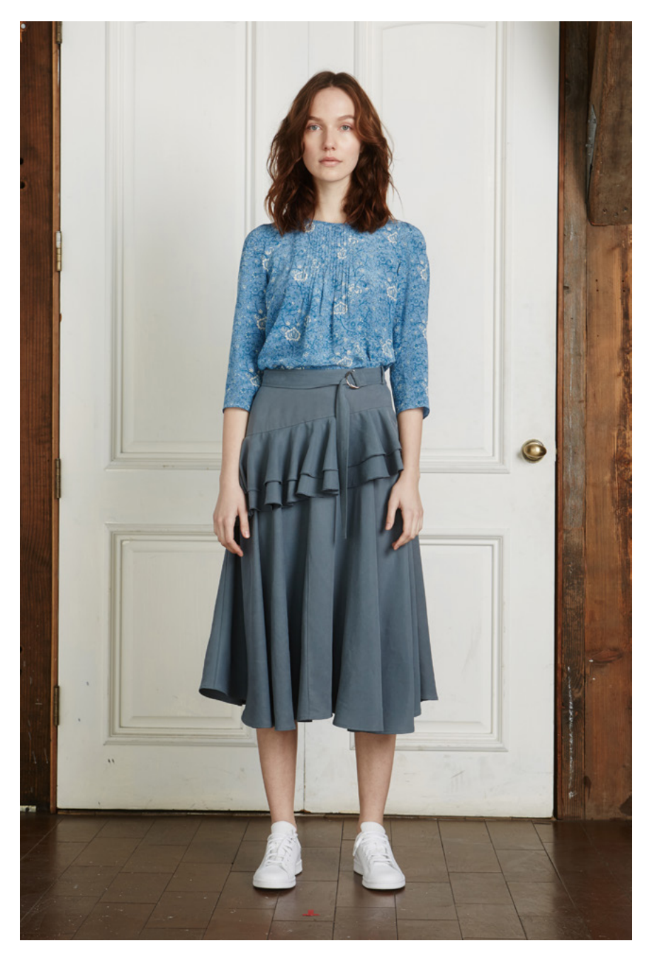
Look 10: Gaia Top, "Bramble" Hand Screen Print on Silk Crepe, Sky Blue Ground w/ Flowers Erica Skirt, Tencel™, Storm