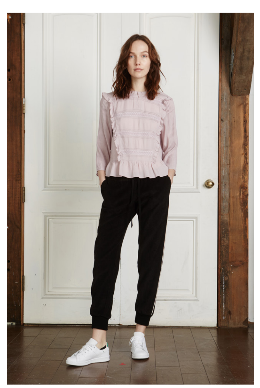
Look 21: Tanya Top, Cotton Lace and Knots on Viscose, Heather James Pants, Organic Hemp / Cotton Corduroy, Black w/ Ivory