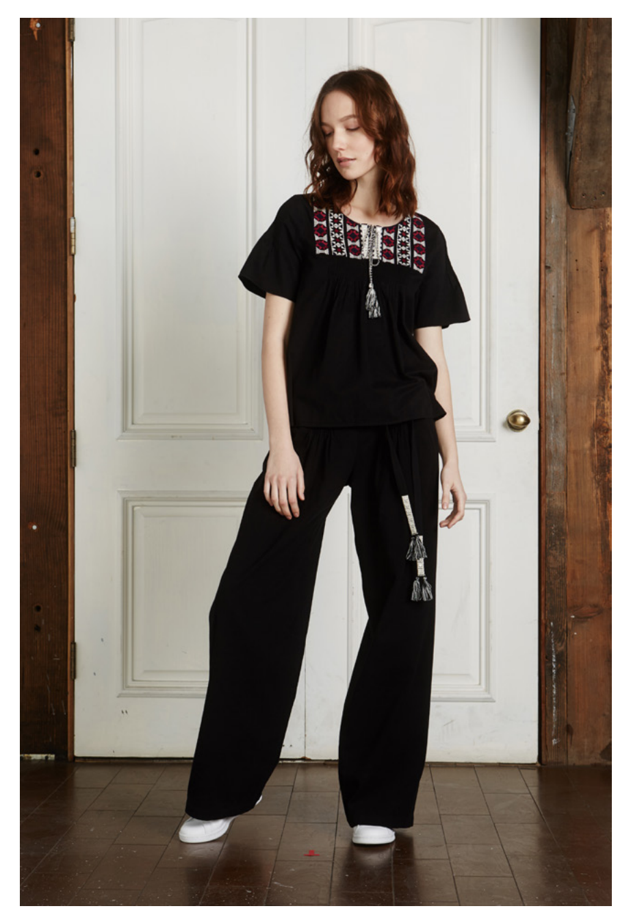
Look 6: Lily Top, "Elgin" Embroidery, Brushed Cotton, Black Pintuck Pants, Brushed Cotton, Black