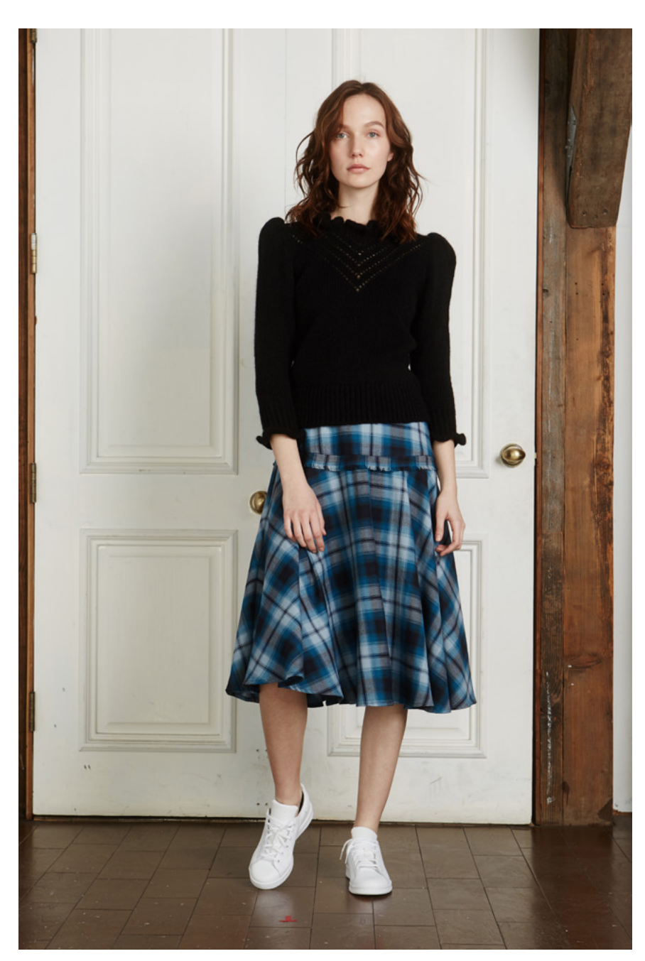
Look 14: Jemima Sweater, "Pointelle" Knit, Alpaca, Black Daisy Skirt, "Westway" Brushed Cotton Flannel, Blues Plaid