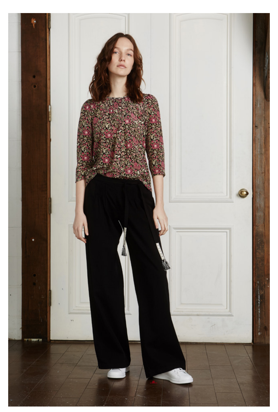
Look 5: Gaia Top, "Bramble" Hand Screen Print on Silk Crepe, Black Ground w/ Flowers