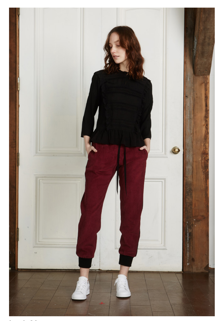
Look 26: Nell Sweater, "Pointelle" Knit, Alpaca, Black James Pants, Organic Hemp / Cotton Corduroy, Garnet w/ Black