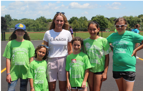
Clockwise from top: Campers honing their skills in volleyball, ball hockey, sprinting, basketball, and Ultimate Frisbee Above: Campers with Canadian Olympic sailor Ali ten Hove.