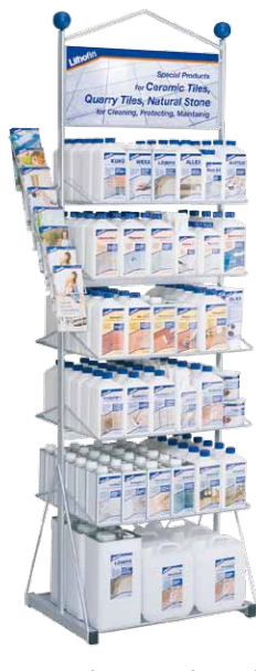
sales stand maxi