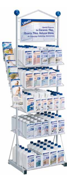
sales stand midi