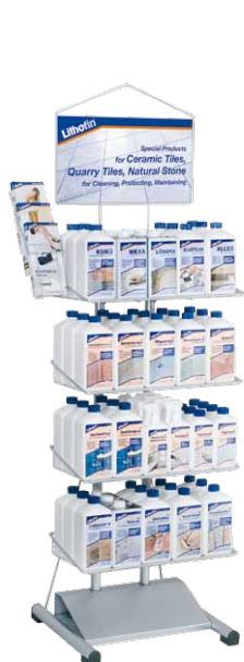
sales stand mini

67 x 50 x 208 cm, holds about 200 bottles