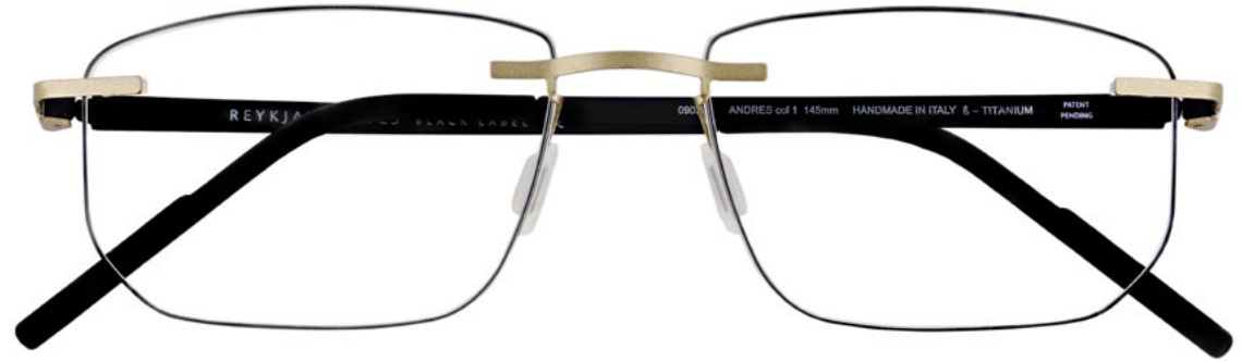
FRAME COLOUR // C1 - GOLD & BLACK SILICONE BAND COLOUR // BLACK