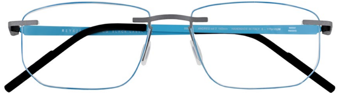
FRAME COLOUR // C2 - LIGHT GUN & BLUE SILICONE BAND COLOUR // BLUE