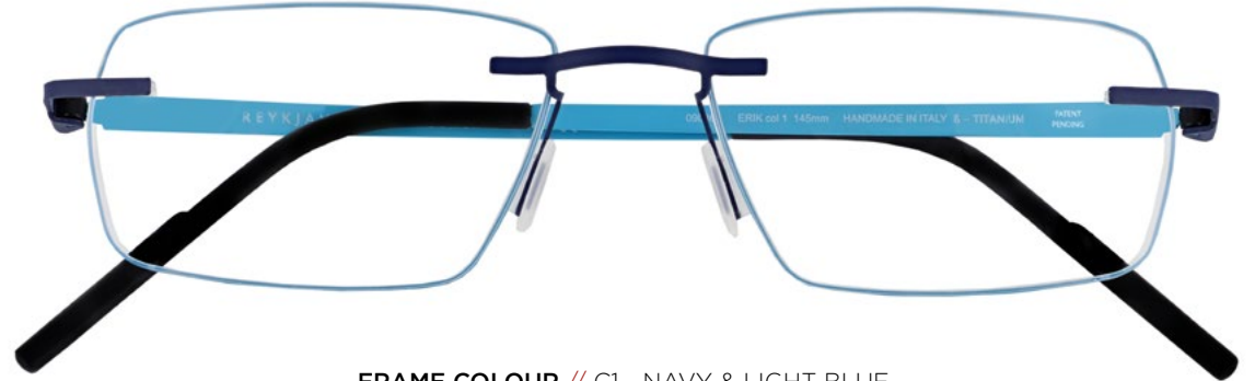
FRAME COLOUR // C1 - NAVY & LIGHT BLUE SILICONE BAND COLOUR // LIGHT BLUE