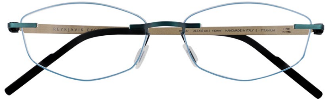
FRAME COLOUR // C2 - BRUSHED TEAL & GOLD SILICONE BAND COLOUR // TEAL