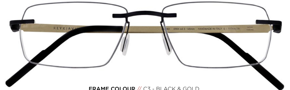
FRAME COLOUR // C3 - BLACK & GOLD SILICONE BAND COLOUR // BLACK