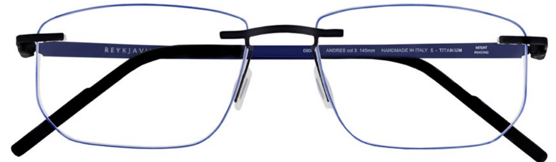
FRAME COLOUR // C3 - BLACK & NAVY SILICONE BAND COLOUR // NAVY