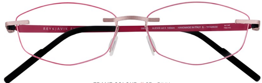
FRAME COLOUR // C3 - PINK SILICONE BAND COLOUR // PINK