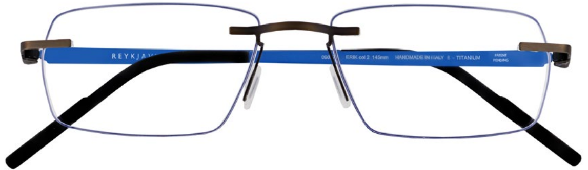
FRAME COLOUR // C2 - BRUSHED BROWN & BLUE SILICONE BAND COLOUR // BLUE