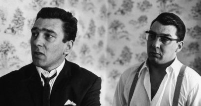
Kray Twins, 1950s-1960s