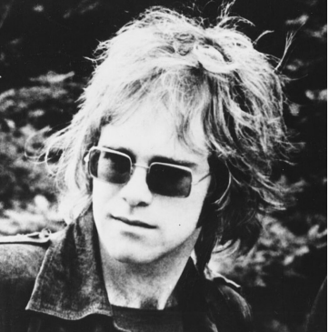
Elton John, 1970s Square metal retro suns