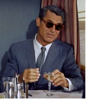
Cary Grant North By Northwest 1959