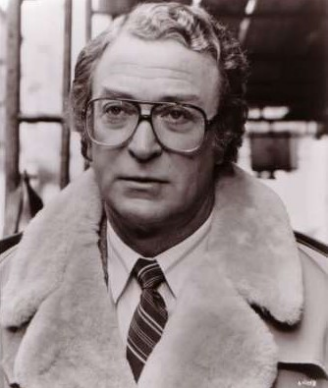
Michael Caine, 1980s.