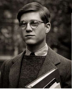
Iconic prep attire, 1950s