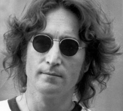
John Lennon, 1960s.