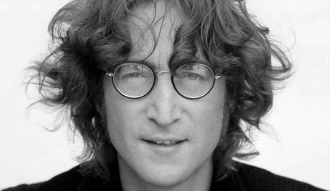
Iconic prep look, 1960s.