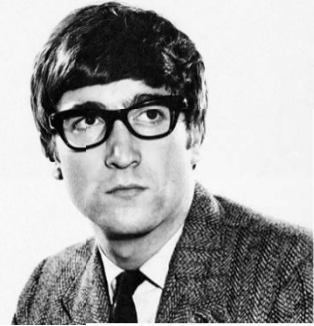
John Lennon, 1963 Chunky thick retro glasses