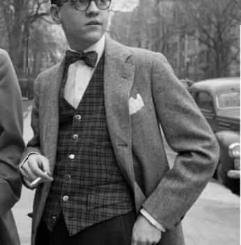
Iconic prep attire, 1950s