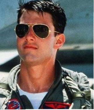
Tom Cruise Top Gun 1986