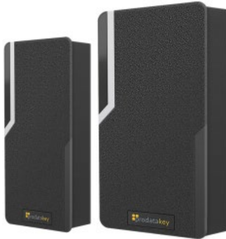
Mullion Reader - PN: RDRM