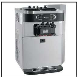
Shown with optional top air discharge chute.