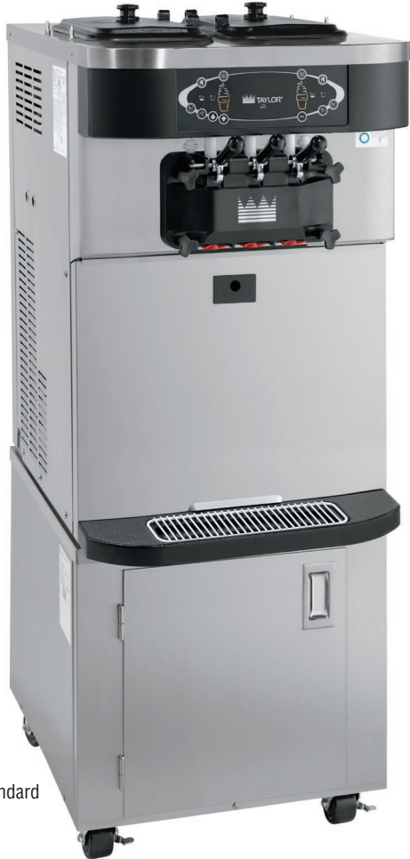
Shown with optional standard height cart.