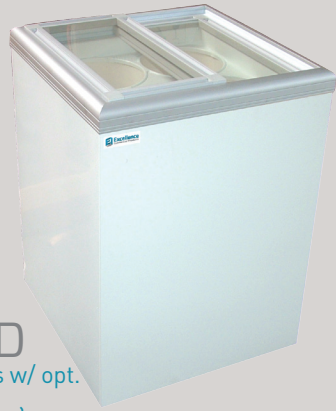
ISL 5D (Glass lids w/ opt. can holders)