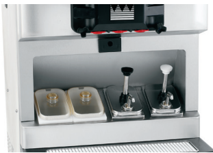
Integrated Syrup Rail Option

2 room temperature with lids & ladles, 2 heated with syrup pumps