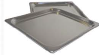
JOF-23 Aluminum Pan W: 14" D: 12-3/4"