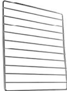
JOF-23 Wire Shelf W: 14" D: 12-3/4"