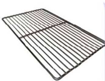
JOF-ONE Wire Shelf W: 23-1/2" D: 15-3/4"