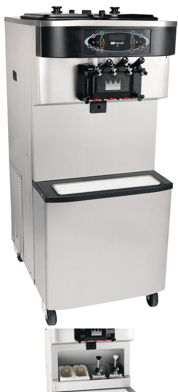
Integrated Syrup Rail Option 2 room temperature with lids & ladles, 2 heated with syrup pumps