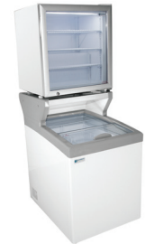
Combo MCT-2HC with one optional CTF-3HC