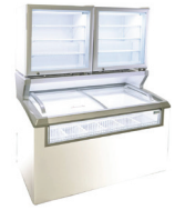
Double Combo-MCT-4HC with 2 optional CTF-3HC