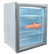
Optional lighted door graphic