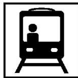
Nose End Cleaning