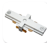
CLLA2 - Mini connector