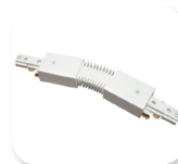
CLLA3 - Flexi-connector