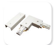
CLLA12 - Straight/L connector