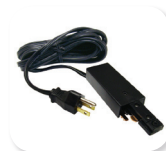
CLLA6 - End feed w/cord & plug