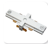
CLLA2 - Mini connector