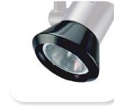
LA620 - shade