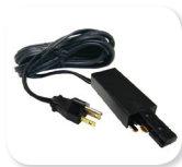
CLLA6 - End feed w/ cord & plug