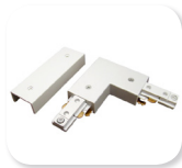
CLLA12 - Straight/L connector