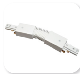
CLLA3 - Flexi-connector