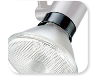
LA638 - lamp collar