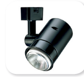
Lamp holder without shade