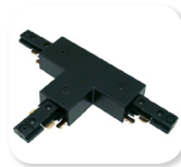
CLLA15 - T Connector