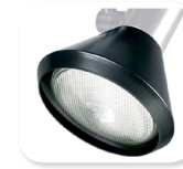
LA6838 - shade