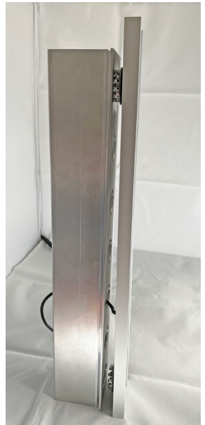
Copyright © 2023 Display Supply & Lighting, Inc. All rights reserved. All brand or product names are trademarks or registered trademarks of their respective owners. Due to continuous improvements and innovations, specifications may change without notice.