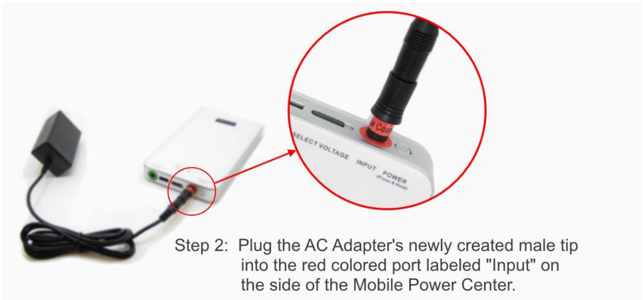
Step 2: Plug the AC Adapter's newly created male tip into the red colored port labeled "Input" on the side of the Mobile Power Center.