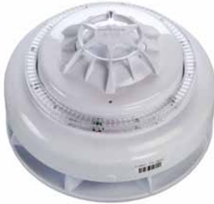
XPA-CB-14025-APO XPander Combined Sounder Visual Indicator (Clear) and Heat Detector (Class A1R)