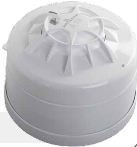
A1R XPA-CB-11170-APO CS XPA-CB-11171-APO XPander Heat Detector with Radio Mounting Base