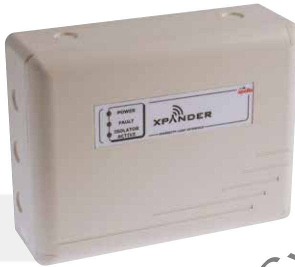
XPA-IN-14050-APO XPander Diversity Loop Interface