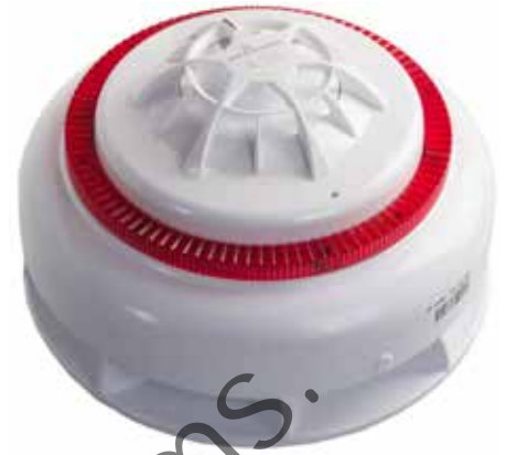
XPA-CB-14021-APO Combined Sounder Visual Indicator (Red) and Heat Smoke Detector