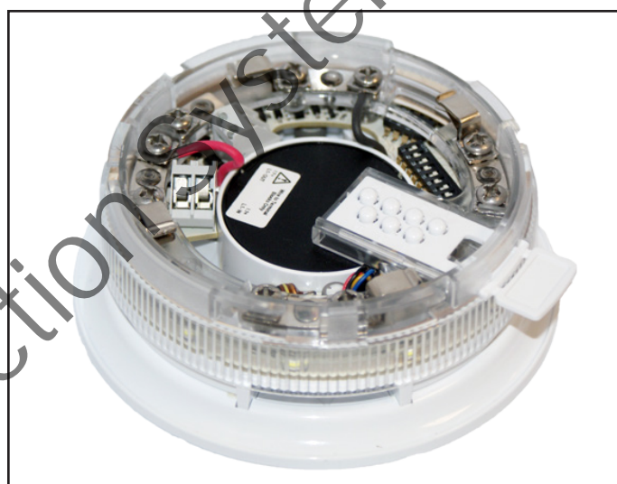
Part no 45681-705 - XP95 Sounder VAD Base with Isolator