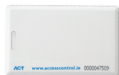
ACTProx HS-B Half shell proximity card Not suitable for printing