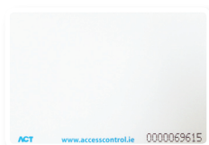
ACTProx ISO-B Proximity card Suitable for printing