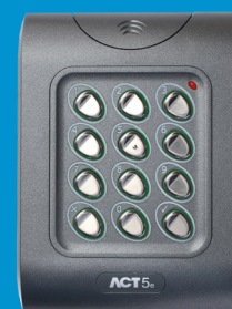
ACT 5e Digital Keypad