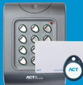
ACT 5e prox Digital Keypad & Proximity