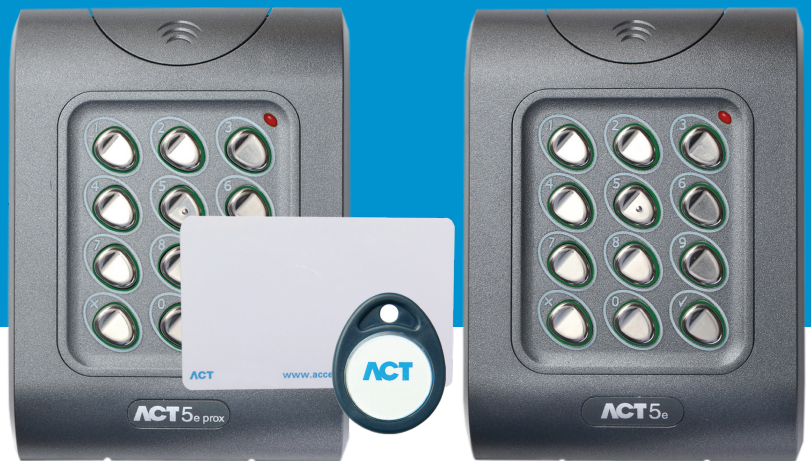
ACT 5e prox Digital Keypad & Proximity