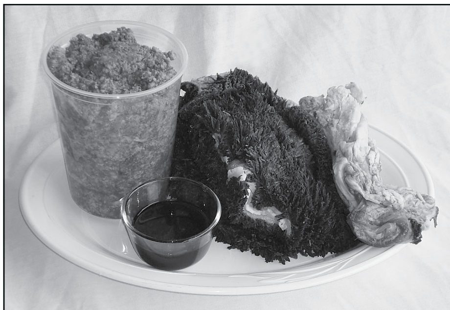
A Place For Paws sells many types of raw diets for dogs, including ground tripe (in the container at far left). A Place For Paws grinds the fresh "green" (raw, unprocessed) tripe (the two tissues at right) with fresh cow blood (for consistency).

"The first time I brought a cow's stomachs straight from a farm," she says, "it was a hot day, the drive was over 100 miles, and the container in the back of my truck stank to high heaven. When I finally got home, the dogs went berserk. They couldn't see the truck, but they were so excited by the smell they were screaming."