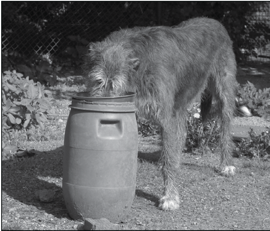
Jade is a six-year-old Irish Wolfhound, belonging to Ika and Ulli Peiler, of Sligo, Ireland. The Peilers have raised Wolfhounds on diets comprised mostly of green tripe for almost 30 years.

factory in Hollister, California. “We started in a 1,000 square-foot building,” she says. “Now we’re in a 6,000 square-foot building. The word has definitely gotten out.” Every week, Voss ships 8,000 to 10,000 pounds of frozen, raw, green tripe from pasture-fed cattle to dog lovers across the country.