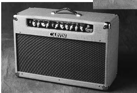
212 Bel Air™