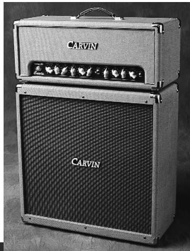
VT50 Vintage™ 410 Speaker