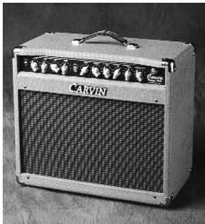
Vintage 33™ Nomad 112™