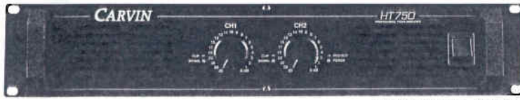
HT400, HT750, HT1000

The HT Series professional amps are designed utilizing Carvin's 33 years of experience in power amp technology. They meet and exceed every standard for professional amplification. Their thick brushed anodized aluminum face plates, large recessed knobs and heavy-duty steel chassis reflect the manufacturing quality within. The HT "High Energy Transfer" amps are available in three different models. All models carry the CE approval for world-wide use.