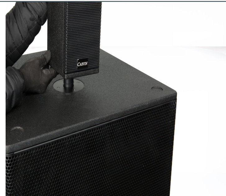
» Secure the TRx3900 using the included SS7 speaker pole adapter.