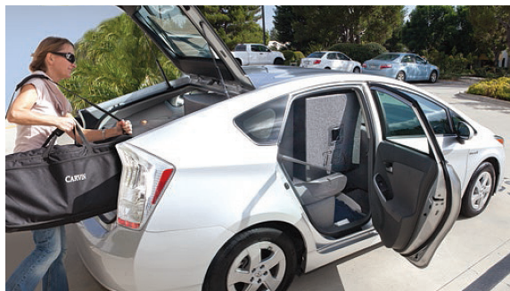
Prius transporting a TRC400A system