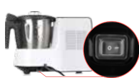
Press the power switch to the ON position before use