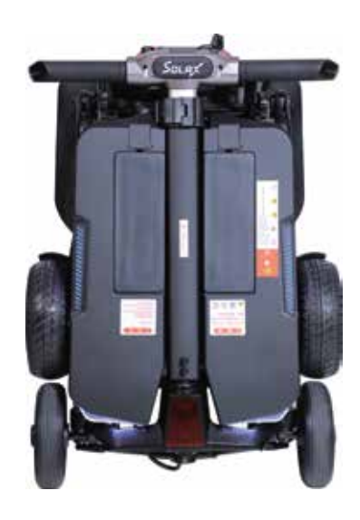
Fig.1 Solax Maleta (Aluminium alloy)

Finally, we hope that your new Solax Maleta will help you enjoy a more comfortable, convenient, and wonderful life.