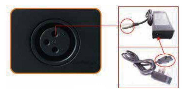
Fig. 21 Fig.22