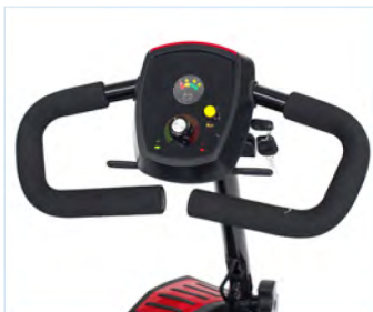
Delta Bars as standard.