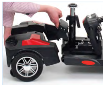
Splits easily in seconds.