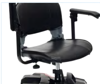
360° swivelling seat.