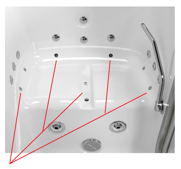
5. Air Jets