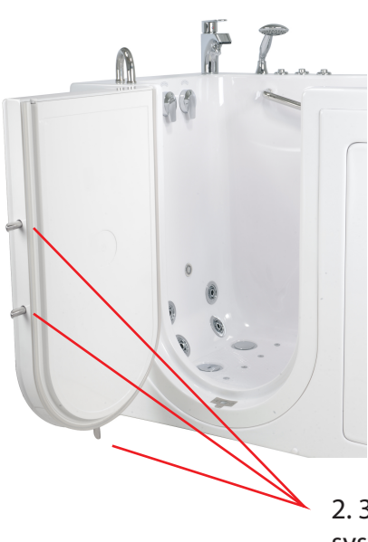
2. 3 latch door system