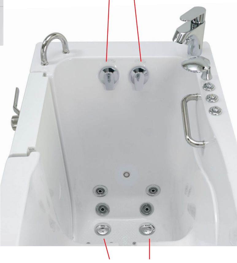
2. 2" Floor Drain/s