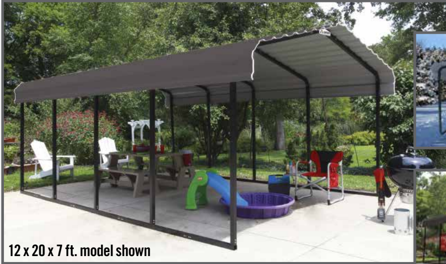
12 x 20 x 7 ft. model shown

Multi-use shelter and carport – perfect for vehicles, boats, tractors, and outdoor picnic areas and patio furniture.