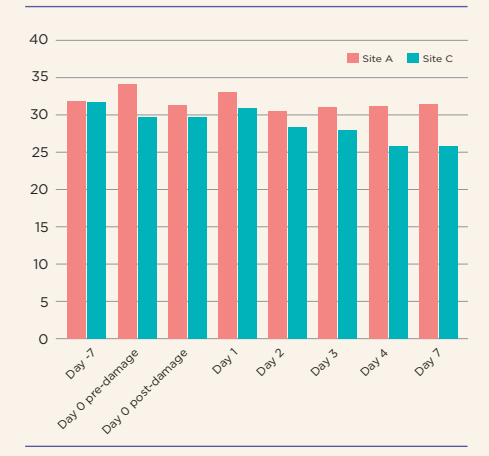
Figure 3. Site A & Site C moisturisation values

Moisturization levels increased for site A from day -7 to day 0, whereas levels at site C decreased during this time (Fig. 3).