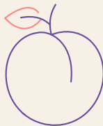
DAY 10 60-80ml