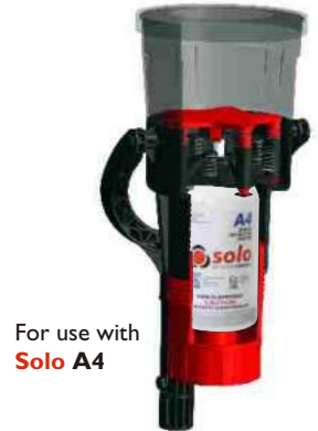
For use with Solo A4

Solo 332 Aerosol Dispenser for larger diameter detectors.