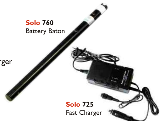
Solo 725 Fast Charger