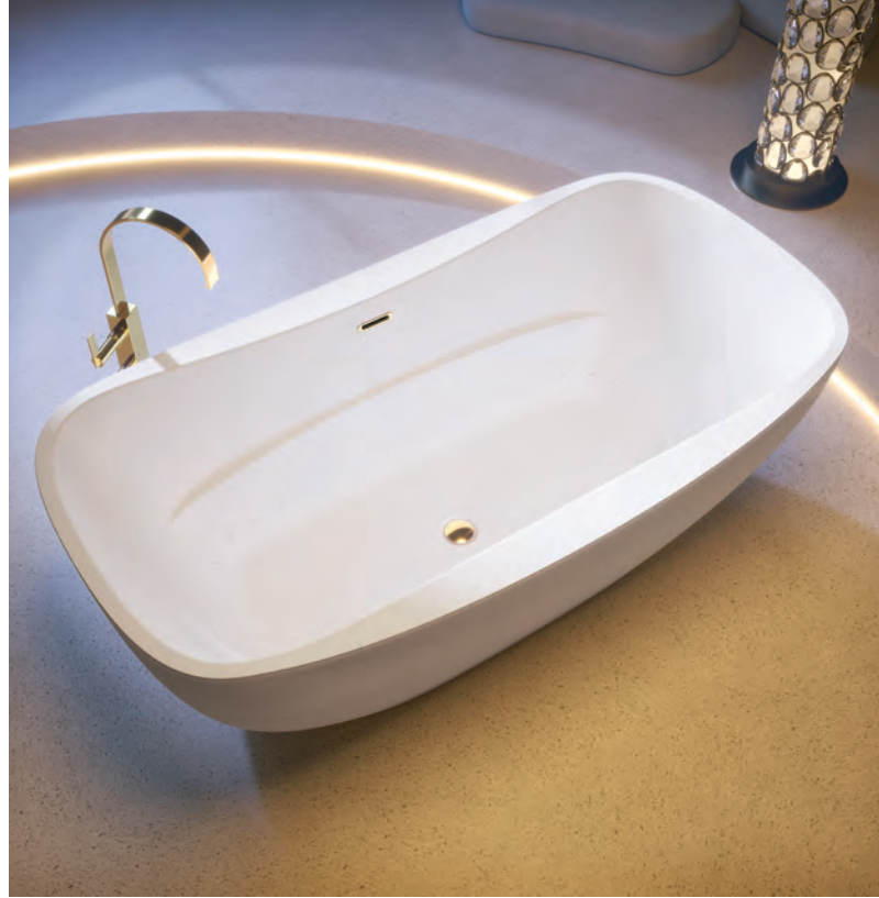
LIBRA STELLA 7038 (FREESTANDING)