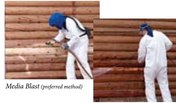
Media Blast (preferred method)

Osborn® is a trademark of Osborn International.