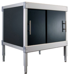
Height Adjustable Table

Having a strong stable table increases the life span of equipment and eliminates service activity related to weak, wobbly tables. Increase the life of your investment by providing a strong, stable platform.