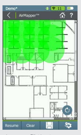
AirMapper™ Site Survey App