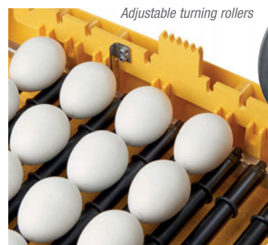
Adjustable turning rollers

Brinsea's Induced Dual Airflow system represents a breakthrough in incubator design and achieves new levels of temperature consistency for optimum incubation conditions.