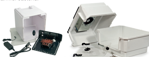
Easy clean cabinet designs

The lower half of the TLC-40 and 50 Series II & Zoologica cabinets and doors are removable, allowing them to be scrubbed and immersed. The upper parts of the cabinet can be wiped clean and the fan guard is detachable giving easy access to clean the fan. To reduce the risk of infection Biomaster™ Antimicrobial Protection is embedded within the incubator cabinet plastic during manufacture which prevents the growth of harmful bacteria.