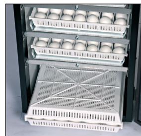
Universal Egg Trays and Hatching Tray