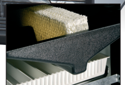
Integral water tray and airflow control