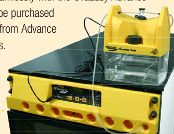
Humidity Pump Module connected

All the standard OvaEasy Advance series II models provide a continuous readout of incubation humidity and require the user to alter humidity to achieve the ideal average level. The EX version with the Humidity Pump effectively maintains the humidity level precisely at the level the user sets irrespective of changes in room humidity and so overcomes problems that can commonly lead to eggs failing to hatch – especially in the latest stages of incubation. The Humidity Pump includes an external water reservoir eliminating the chances of water in the incubator harbouring bacteria. The Humidity Pump module is designed to work seamlessly with the OvaEasy Advance incubators and can be purchased later as an upgrade from Advance to Advance EX status.