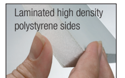
Laminated high density polystyrene sides