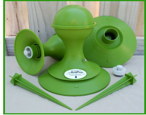
Dispenser and assembly breakdown