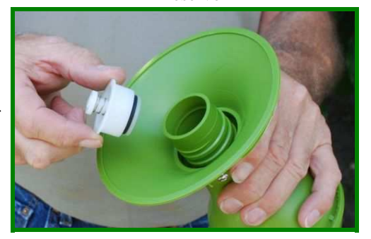
Insert flow switch