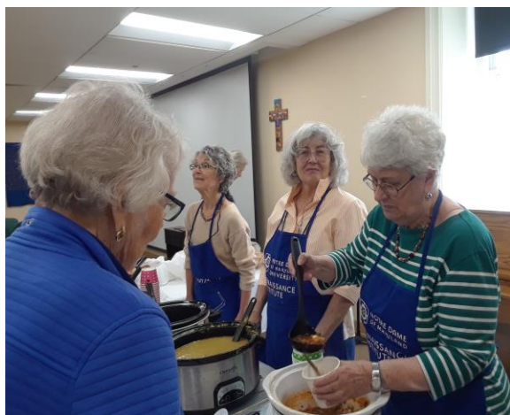
The Bread and Soup "Free Lunch" event, sponsored by the Social Committee, was a great success.