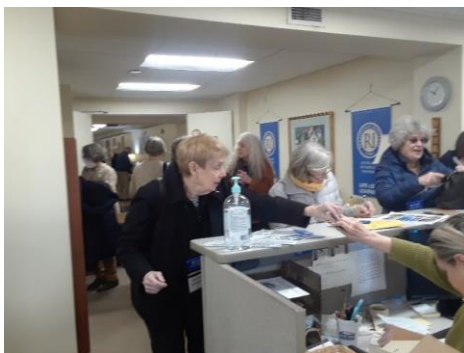
New members pick up their ID badges, tour the FIC, and stay for coffee, bagels, and conversations

“Joining RI seems like a big adventure, the first in my recent retirement.” Another person declared, “I love being back in school with no tests or exams to worry about.”