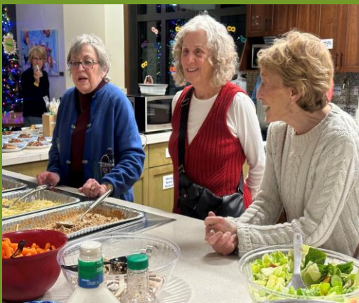
Serving a Meal at Ronald McDonald House – a Renaissance Tradition