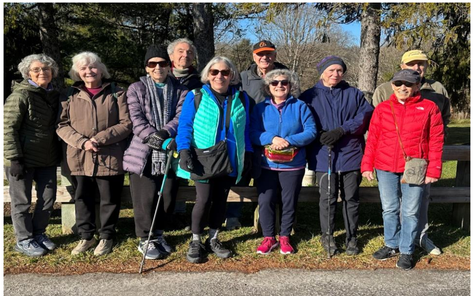
A sample of Winter in the City – Sangam Indian Cuisine & a Hike on the NCR trail