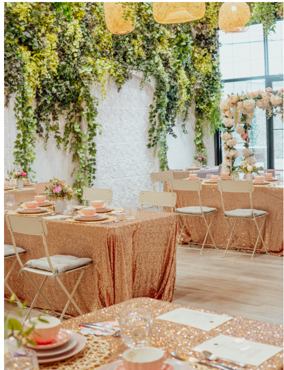
Floor-length luxury sequin tablecloths in pink