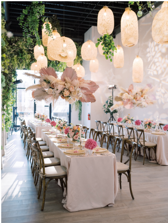
Floor-length luxury satin tablecloths in blush

*Dinnerware, glassware, flatware and paper napkins are included in catering prices