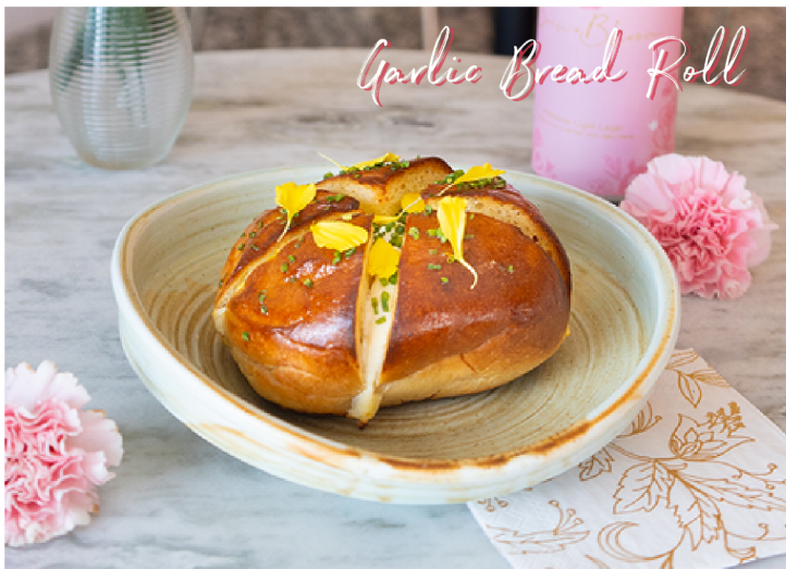
Garlic Bread Roll