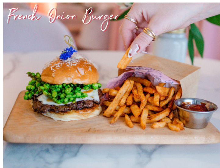
French Onion Burger