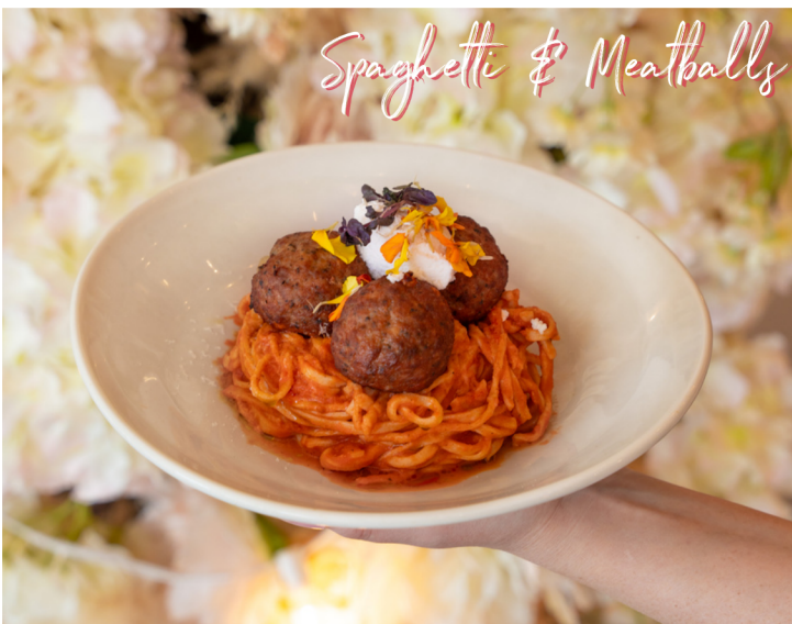
Spaghetti & Meatballs