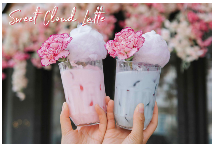
Sweet Cloud Latte