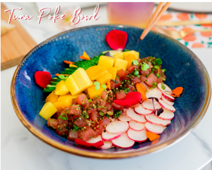
Tuna Poke Bowl