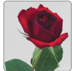
Control - Rose