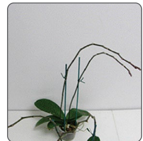
Control - Orchid