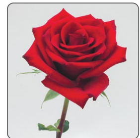
EthylBloc™ Treated - Rose