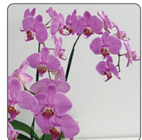
EthylBloc™ Treated - Orchid

FOR MORE INFORMATION, LOG ON TO FLORALIFE.COM